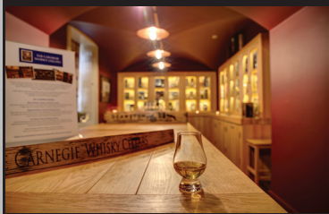
Carnegie Whisky Cellars