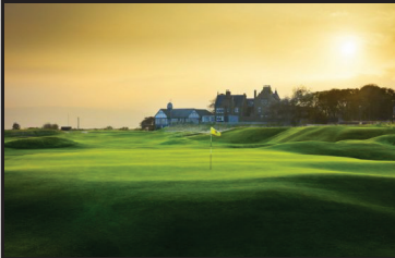
Royal Dornoch Golf Club