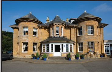
Royal Golf Hotel